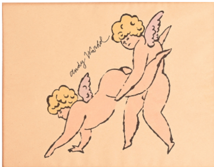
Two Angels Playing (from the In the Bottom of My Garden series)