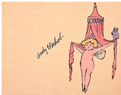
Fairy and Owl (from the In the Bottom of My Garden series)